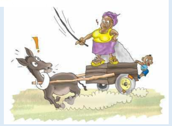
Sticks 2 Fuel Standards