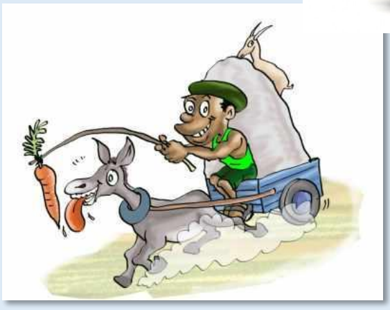
Carrots 3 Market Based Measures